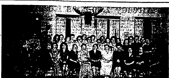
State officials and visiting Pocatello members assisted in the Saturday installation of a new Magic Valley grove of the Supreme Foresters Woodmen Circle...