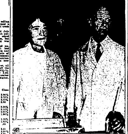
Dr. Grerty Theresa Curt (left) and Dr. Ferdinand Curt (right), husband and wife, were announced in Stockholm as the Nobel prize winners in medicine for their work in crystallizing and isolating enzymes.