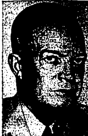
DWIGHT D. EISENHOWER