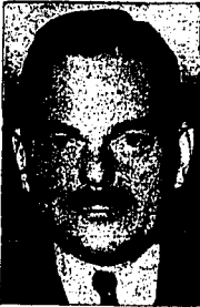
THOMAS E. DEWEY