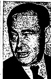
JOSEPH W. MARTIN