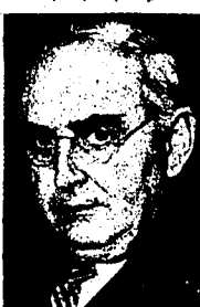
ARTHUR H. VANDENBERG