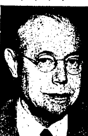
ROBERT A. TAFT