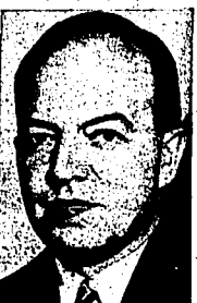
HAROLD E. STASSEN