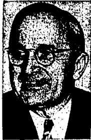
HARRY S. TRUMAN