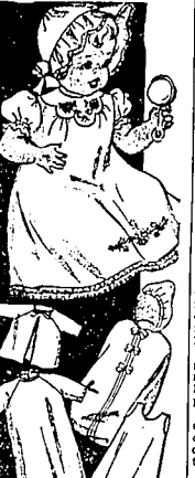
9437 ONE SIZE

FOR THE NEW BABY Welcome home New Baby with this Pattern 9437 that has everyday clothes and a precious so-valuing dress. Eight things in all, in this adorable little, including, and with heart insert. Transfer, too.