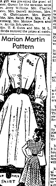
9483 SIZE 11-17