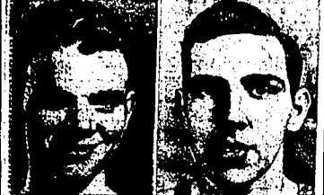
The first Associated Press All-American college basketball team, selected on a point basis by votes from 231 sports editors...