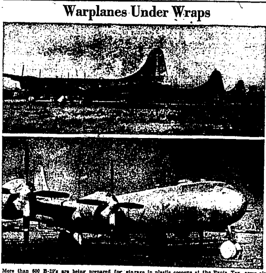
More than 600 B-29's are being prepared for storage in plastic cocoons at the Floyd, Tex., army airfield. Top: Assembly-line technique is used in coating the planes. Bottom: Close-up of a B-29 after being encased and sprayed.

WE WRITE FIRE & AUTO INSURANCE Old Established Co. Be Sure You Are Insured Ben Arpey, 113 2nd St. W.