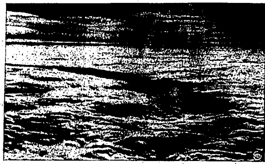
What happens in a 16,000-foot cloud bank when the weather-makers go to work on it is shown in this signal color photo, taken 44 minutes after the clouds had been "seeded" with dry ice. Dark area across the center is a channel of precipitation, 1.3 miles at its widest point. Scientists figure that dry ice they've caused more rain than they have rain.