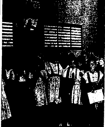
Displaced children from Europe, like the blond girl at the right of this group, are part of Venezuela's program for building up her population for the work to be done when oil riches fade. The playmates of this girl, who is attending a modern school while awaiting assignment to a permanent home, say she is related to the great Austrian composer, Johann Strauss.

modern agricultural development, for gold and diamond mining, for brick and cement and lime and plumbing supply industries.