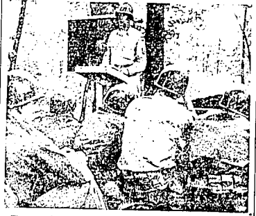
The arrow beneath the sign in photo at right which points the way to the army's UMT experimental unit also points the way to plans the armed forces are drawing up in case congress follows the President's plea for universal military training. Biggest problem would be lining up instructors, like the one above teaching teen-age "guinea pigs" at the Fort Knox unit.

plans to put all of its trainees aboard ships as top experts. All the navy trainees will be dry-land sailors, however, who will learn amphibious training after the first 12 weeks of basic training. In addition to preparing for the physical and personal needs of UMT, there is a lot of unexciting paper-work and planning. The army has shown the most interest in putting the idea, and with its vast power experience, has the details of its program fairly well completed. But the air force and navy experts, up to now less enthusiastic about UMT, haven't worked out their plans in such detail. Broad outlines of the overall plan, however, are pretty well established. When the program is in full swing, the army would be getting about 432,000 boys a year, the navy and marines corps about 272,000 and the air force 150,000. This is based on the estimate that 1,000,000 U. S. boys will become eligible each year, up to now less enthusiastic about UMT, haven't worked out their plans in such detail. After the first six months, trainees would have about 14 months of straight training and be reserved for a stated period of enlistment, for special college or technical courses, or enlisted in the regular service for one year in one of the services. The total annual cost of the plan is estimated at $1,500,000,000 if the 21, as has been proposed, they are given 20, the cost of universal military training would be about $2,000,000,000.