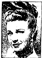
Seventeen years didn't change Ginger Rogers too much. The picture at left was made in 1931 when she was 19. The other picture shows the glamorous film queen today. Except for the color and style of her hair, there's not much difference.