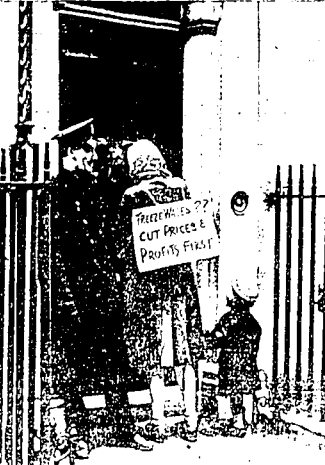
Her protest against the high cost of living... she drops a letter addressed to Clripps in the letter-box at No. 11 Downing street.

This London housewife carries her protest against the high cost of living... she drops a letter addressed to Clripps in the letter-box at No. 11 Downing street.