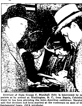
Secretary of State George C. Marshall (left) is interviewed by reporters as he arrived at Washington, D. C. from Bogota, Colombia, where he has been attending the inter-American conference.

WASHINGTON, April 26 (AP)—A program of military backing for the anti-communist bloc in western Europe is expected to be in the final stages of administration planning.