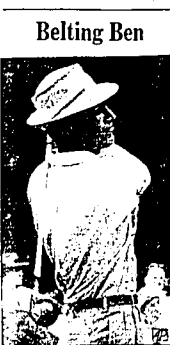
BEN HOGAN, who is one of the favorite to capture the United States open golf tournament title, takes practice swing. The open got away Thursday at the swank River Country club in Los Angeles.