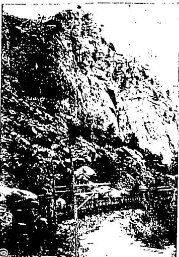
Good idea of how the Rapid City, Black Hills and Western won its name as the "crookedest railroad in the world" is the scene "as it is" of its 14 complete circles on a 21-mile run. New track workers are pulling up the rails to end the crooked road's hectic career.