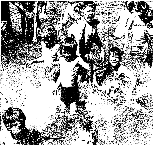
Although the municipal swimming pool at Harmon park has been opened only since Tuesday, Twin Falls youngsters wasted no time in setting up their "summer headquarters" at the pool. Expressions on faces of youngsters in the above photo would seem to indicate that the temperature of the water is slightly below the temperature of the air. Photo was taken on opening day at the pool.