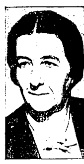
Mrs. Golda Myerson, who was formerly a school teacher in Milwaukee, Wis., is now administrator of Jerusalem and deputy foreign minister of the new state of Israel.

FORD Moving & Delivery Service Local and Long Distance PHONE 227 Twin Falls FORD TRANSFER & STORAGE CO.