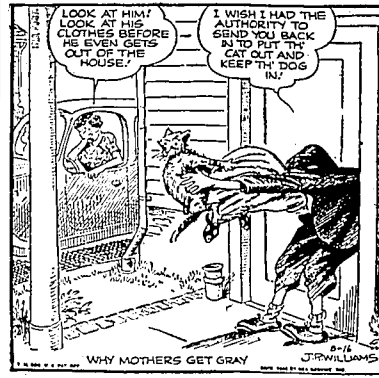
WHY MOTHERS GET GRAY By GALBRAITH