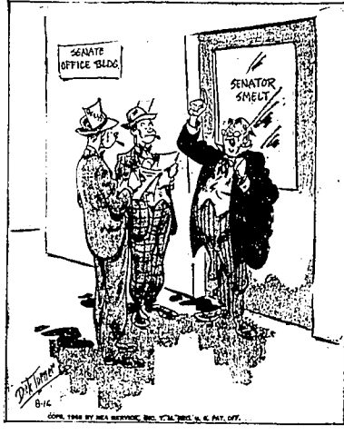
"I'll have you know, sirs, that serving my country turned my hair white—worrying about votes!"