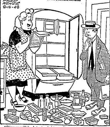
"Dinner will be late tonight... I'm taking inventory."