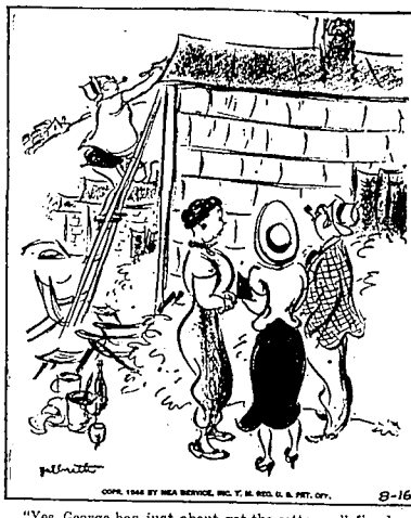
"Yes, George has just about got the cottage all fixed up—we're moving back to the city tomorrow."