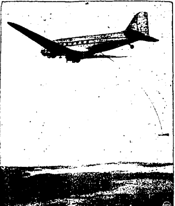
This airplane is prospecting for oil, using a newly developed airborne magnetometer. The instrument, which the plane trails as it demonstrates to the earth's magnetic field. There are recorded in the plane, and data, which would take decades to gather on the ground, is quickly mapped.