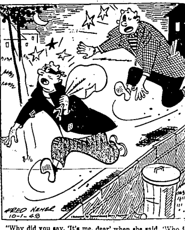
"Why did you say, 'It's me, dear' when she said, 'Who is it?'"