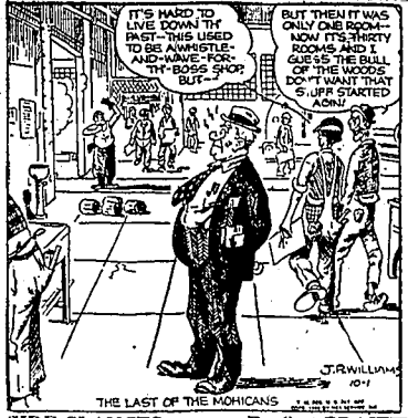
THE LAST OF THE MOHICANS