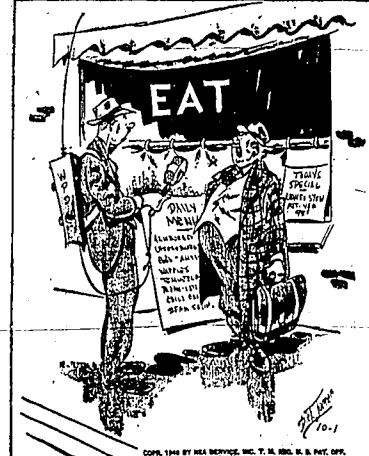
"Do my opinions necessarily have to be those of the 'little man'? I get plenty of that at home and at the office!"