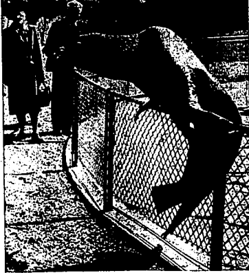
It looks like Snap, the sea lion at the Whippinake, England, too, wants out. Actually, he's just hungry. Snap smells the approach of the skipper with his fish dinner, and likes to meet him half way.