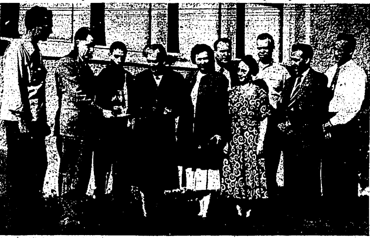
Members of the Twin Falls Junior Chamber of Commerce are shown above presenting a check to the principals of the three local grade schools to purchase 24 raincoats and rain hats for student safety patrols. Each school will receive six coats and hats. Left to right are