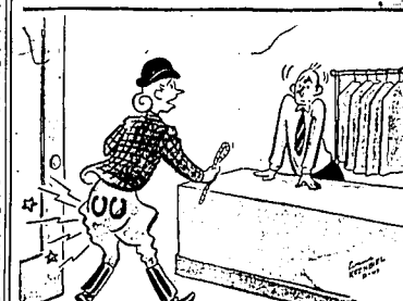
"I UNDERSTAND SANITONE DRY CLEANING REMOVES SPOTS"