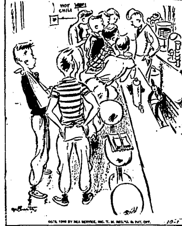
Yen, I'm broke! There's plenty of 'guys' eating in here right now who owe me money, but how can I collect it with a broken arm?