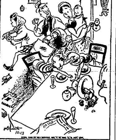
"I was just thinking how sad and lonely we'll be one of these days when they're all married and gone away for good!"