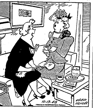
"It's the first dollar I got from my husband... It was quite a battle."