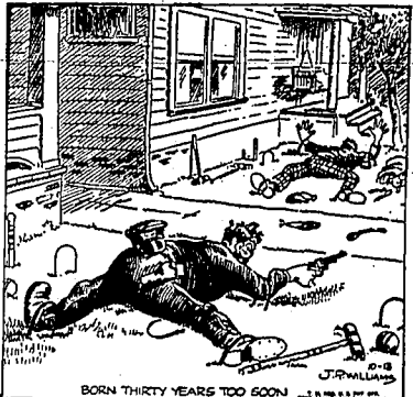
BORN THIRTY YEARS TOO SOON