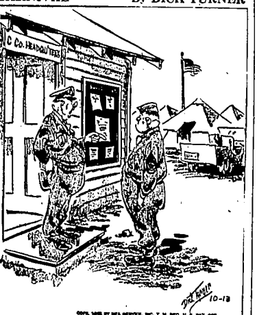
"Keep the new men busy, Sergeant! I don't want them to have time to write any of those poking fun at the Army!"