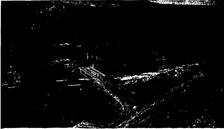
Construction is under way on the Idaho Power company's hydro-electric development on Snake river west of Bliss. Piers for the dam, flanked by water-control cribs, are going up on the far side of the river. The powerhouse, which will have three generators, will be built this side of the piers on the main channel of the river. The dam and powerhouse will have a total height of 138 feet. When the Bliss development is completed, it will add 70,000 kilowatts to Idaho Power's capacity. (Staff engraving)