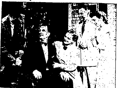
Shown above is a scene from "All My Sons," first of a series of three plays staged by the Lions club. New York players will present the show which was declared a hit of the last season on Broadway.