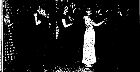
Honoring the golden anniversary of the VFW, a formal Christmas ball was held Wednesday evening at the Radio Boudreau. The committee plans to make this an annual affair to help increase membership in the VFW...