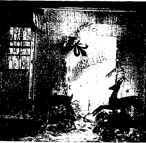
This simple but effective greeting card decoration was awarded first prize in the residential division of the Times-News annual Christmas lighting contest.