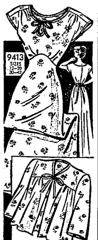
9413 sizes 12-20