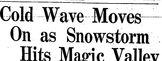
From Times-News Correspondent AP and AP Reports: Minimum temperatures recorded Sunday: Richfield, -19; Burley, -2; Twin Falls, -1; Glenns Ferry, -5; lowest for the season in Magic Valley's "banana belt"; Fairfield, -5; Rupert, zero; Halley, -18; Carey, -10; Bellevue, -2; and Shoshone, -10.