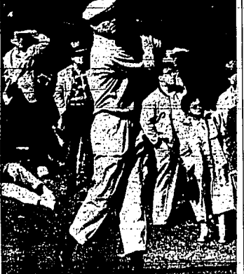
Golfer Ben Hogan took off at Cypress point as Bing Crosby's 1946 season... (Text continues with details about the golfer's performance and the event.)