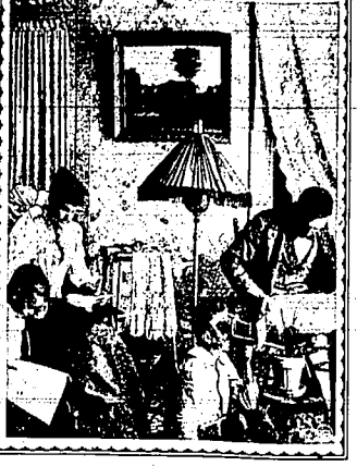
Family life in the early 1900's was just that—much more of a reality than in later decades. When outside affairs hared the family from the hearthside. In this commonplace turn-of-the-century scene, it is perhaps significant that three of the family are reading. The youngster on the floor is being waddled to faraway places by the stereoscope, that indispensable adjunct of post-Victorian culture. His father probably has one with his present-day descendant. As he reads his newspaper, he probably grows as matter that the country's going to the bow-wow and somebody ought to head off that dad-blamed congress before it bankrupts all of us. And another, unlike her voting granddaughter, probably murmurs "Yes, dear."