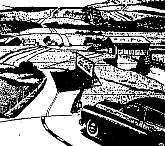
In rolling hills with woods, curves and cuts, beware of unexpected ice spots. The roadway may be entirely clear except in low and shady spots. These death lurks.