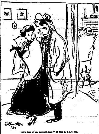
"It looks a lot like rain tonight—I wonder if your father thinks more of his new car with the automatic drive than he does of that beautiful new dress of yours!"