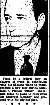
Freed by a federal jury on charges of fraud, the man was acquitted.