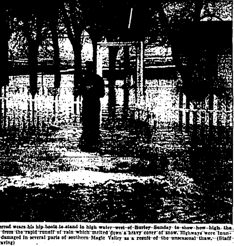
Fred Sherrod wears his hip boots to stand in high water west of Burley Sunday to show how high the water rose from the rapid-train which was derailed by a heavy cover of snow. Highways were inundated and damaged in several parts of southern Magic Valley as a result of the unseasonal thaw.