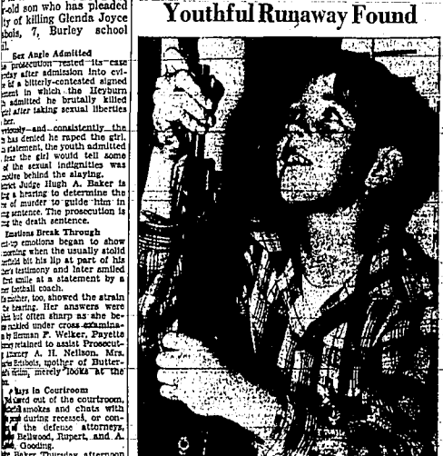
Youthful Runaway Found