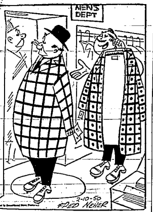
I just a question of taste... One is plain and the other is a tad in it!