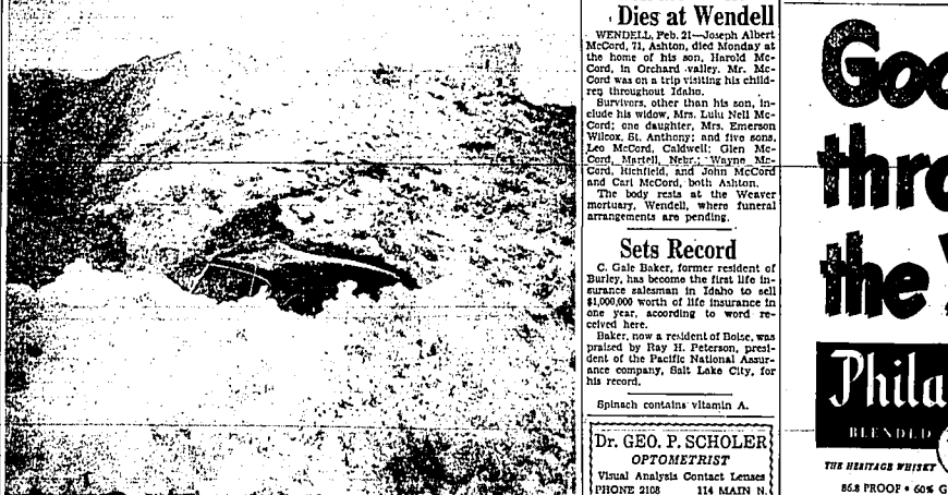
Fullfield residents are finding something new every day as heavy snow recedes. The snow has piled up on the street, and the scene is captured in a black and white photograph.