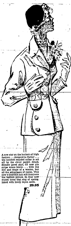
A new star on the horizon of high fashion... designed to flatter... the notched rounded collar is set off by the clever pocket's detail. Slender gored skirt. Of new pin stripe weave fabric... with the feel and drape of a woolen, but all the advantages of rayon. This new 4-CASTER suit will dominate the fashion picture. In four new muted tones that sing of spring. Lined with lovely rayon satin. 29.95

4-Caster. .... the perfect SUIT for year 'round wear