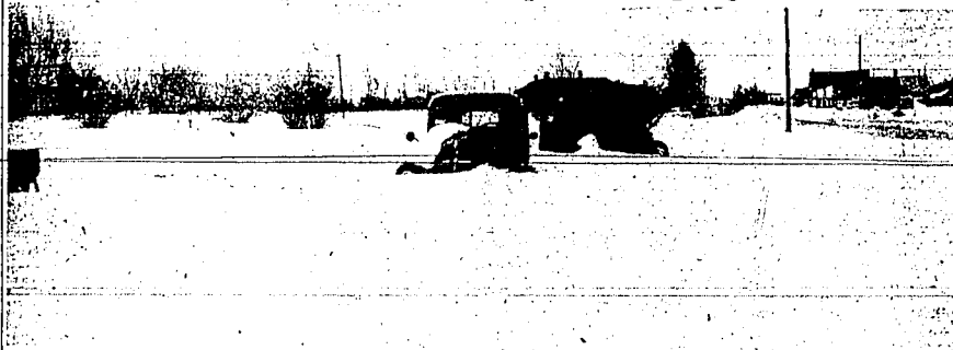
Automobiles, trucks, and trailers are appearing in Fairfield, Idaho, as the weather warms. The cars are parked along the street, and the scene is captured in a black and white photograph.