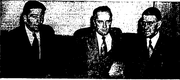
Three Idaho state senators, meeting in Twin Falls Monday, sat down to retrace on the activities of the special session of the legislature...