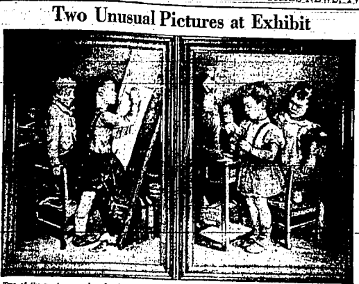
Two of the most unusual and yet appealing pictures of the Heyburn art exhibit opening today are shown above. They are "Artist and Critic No. 1," at left, and "Artist and Critic No. 2," at right.