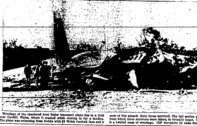
Wreckage of the chartered Aero Tudor transport plane lies in a field near Cardiff, Wales, where it crashed Wednesday. In the background, the plane was returning from Dublin with 84 Welsh football fans and a crew of fire aboard. Only three survived. The full section of the plane, from which three survivors were taken, is virtually intact. The fuselage is a twisted mass of wreckage.