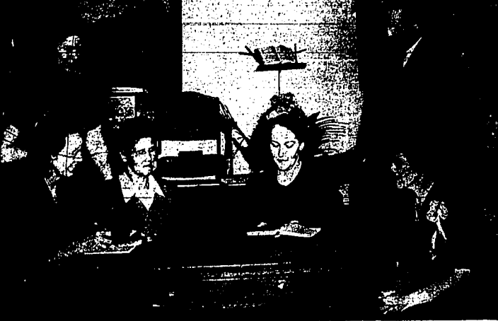
Federation and local leaders of the Dorcas society of the Seventh-day Adventist church met Tuesday to discuss methods of promoting welfare work...