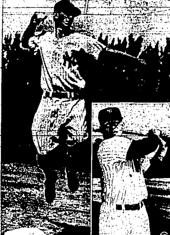
Billy Martin, left, and Jackie Jensen, who were purchased from Oakland of the Pacific Coast league, are eye-catching rookies at the New York Yankees.

Champions to Defend Titles at Pocatello POCATELLO, March 15 (UP)—One champion and two runners-up will be on hand in lightweight and welterweight divisions of Idaho State college's fourth annual collegiate boxing tournament, Friday, and Saturday at Pocatello. The