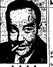
As predicted before the event Thursday night, Broderick Crawford and Olivia De Havilland, above, won 1949 acting honors...