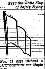
Keeps the White Flag of Safety Flying

The Idaho state employment service, with its 27 local offices, is now offering college graduates the aid of the state in finding jobs. The service is now offering college graduates the aid of the state in finding jobs. The service is now offering college graduates the aid of the state in finding jobs.