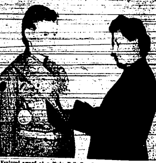
Featured award at a Twin Falls Boy Scout district court of honor...