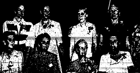
Shown above are new and old district officers of the Royal Neighbors of America elected at a meeting held Thursday in Hansen. ...