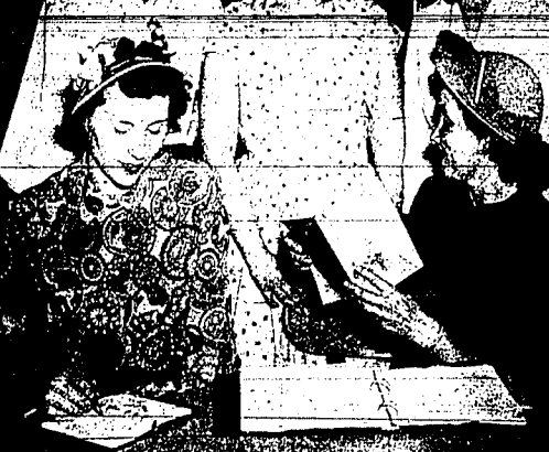
Members of the League of Women Voters plan the "first voter" banquet to be held at the Turf club July 12...