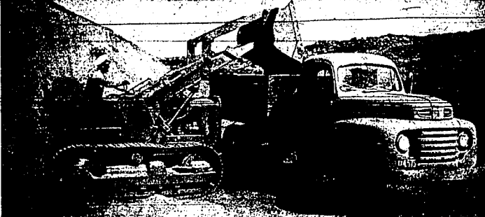
A new 50-horsepower tractor loader purchased by the city of Twin Falls dumps a cubic yard of gravel into the bed of a city truck. The loader, which cost the city $6211, loads a truck with a six-ton bed in about three minutes. Clifford L. McClure, city employe, is pictured at the controls of the loader. The equipment is being used to trash work on city streets. (Staff photo-enlarging)