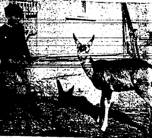
Just a little more than a year ago, the youth shown above was pictured in the Times-News while being bottle-fed by a still-potent orphan nurse fire and the fawn was found by a firefighter, and taken to his home in Summit