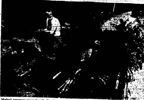
Medical personnel pause to ask directions as they evacuate Americans wounded in battle to a hospital in South Korea. The ambulance is in a jeep convey headed for the front lines, is going into battle well ahead. (NEA telephoto).