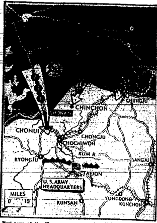
Best news of the Korean war came when Tokyo announced that a "lost battalion" of American troops had fought its way out of encirclement and appeared (large arrow) punched its way into 26 miles of North Korean forces 18 times its size near Chosai. Maps of Taejon, U. S. headquarters and provincial capital, but was halted temporarily by the revived American air and artillery bombardment. Numbers on arrows designate the North Korean divisions involved.