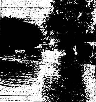
Water fills the main street of York, Nebr., after a torrential 12 inches of rain. The heavy downpour and resulting flash floods in the southeast section of the state forced hundreds of persons from their homes and took five lives.