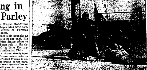
Helmets of U. S. combat engineers and a heavy machinegun fire on snipers in hills near Yongdoo as an ammunition convoy (not above) heads for U. S. troops on the Korean front.