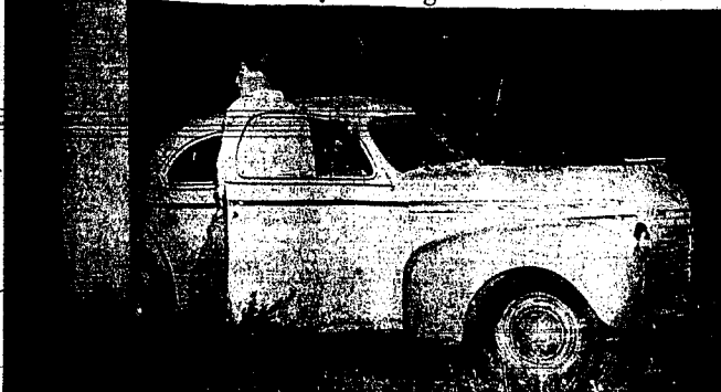
A policeman is shown helping occupants of this car wrecked early Tuesday in the 100 block of Blue Lakes boulevard north. The car jumped the curb on the right side of the street at Washington school. It traveled down the sidewalk, mired in a utility pole and careened across the street where it struck the curb and crashed into a tree.