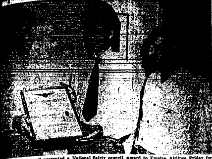
Empire Airlines overall presented a National Safety Council award to Empire Airlines Friday for its safety record during its three years of operation. The airline has flown 17,715,000 passenger miles...