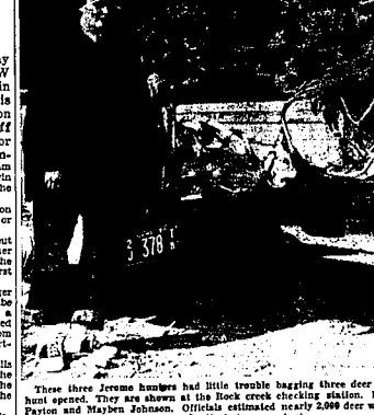
These three Jerome hunters had little trouble bagging three deer Thursday as the Cassin No. 1 special hunt opens at the Rock creek checking station...