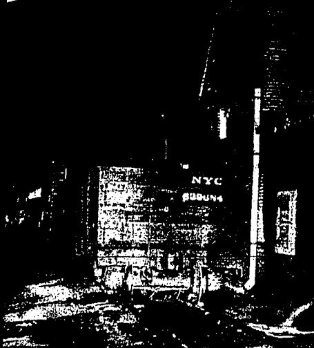
A brick wall on the Northrop-King and company warehouse is shown in photo above at the height of the blaze Thursday night. The wall tumbled on the roadway car stand-off the structure. Photo below shows remains of the principal piece of equipment used by the Idaho fire department. Smoke still rises in the background, obscuring vision Friday morning. Photo at top was taken at the height of the fire Thursday night. Note man on roof of building in foreground and a small hose to keep the roof wet.