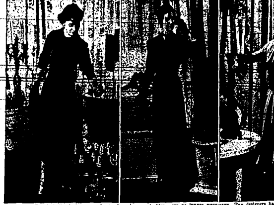
The woman five, five inches, or under need no longer shudder at the thought of buying new clothes. Expensive alterations and materials are no longer necessary. Top designers have solved the problem by creating a new line just for the pint-sized woman.