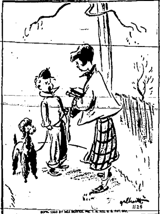
"He does, too, understand French! He just doesn't understand your punk high school French!"