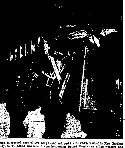
Firemen probe through telescoped cars of two Long Island railroad trains which crashed in New Gardens section of Queens county, N. Y. Killed and injured were homebound bound Manhattan office workers and Thanksgiving day visitors to Long Island homes.