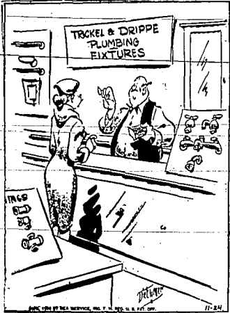
"I'm afraid I don't know what size—but it leaks about a cupful every hour!"