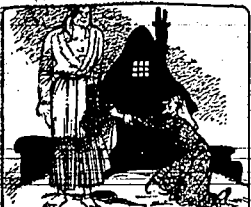
When he heard the Spirit of Christmas Present prophesy of the future of the miserly Scrooge, he was seized with "No, no," he cried. "Oh, no, kind Spirit! Say he will be saved!"