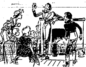
But Bob Cratchit's family was unswayed of the Spirit's prophesy. Generously, Bob proposed a toast to his miserly employer, Ebenezer Scrooge. Mrs. Cratchit refused to drink.