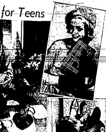
This teen-ager, long on friends and short on cash, makes her own Christmas gifts. The girl is holding a handkerchief (center) on matching corduroy bag and belt set. Other easy-to-make gifts include silk-fringed velvetette stole (upper left), sparkie-studded velvet bell (lower left), Tartan plaid bag and belt (upper right) and satin slippers (lower right).