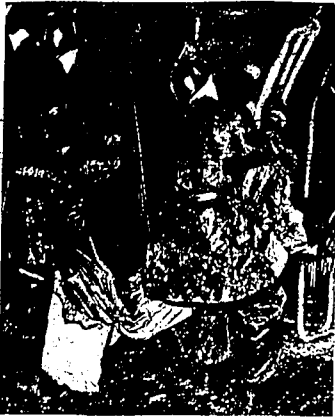
Firemen carry away body of one of the victims of a flash fire that swept through a Chicago flat building during the early morning hours. At least eight persons perished in the flames.