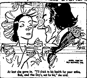
At last she gave in. "I'll drink to his health for your sake, Bob, and the Day's, not for his," she said.