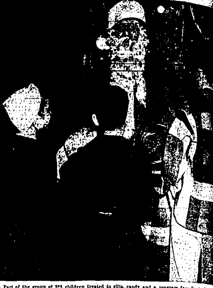
Part of the group of 325 children treated to gifts, candy and a program face Santa Claus and "hunks" for the party presented here Sunday by the Twin Falls Kiwanis club for underprivileged children. The service organization staged the event in cooperation with Twin Falls firemen.