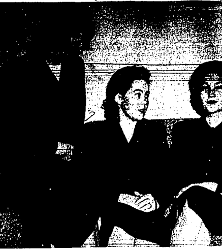
Last details for the Pan-Hellenic hospital benefit dance are discussed by committee members...