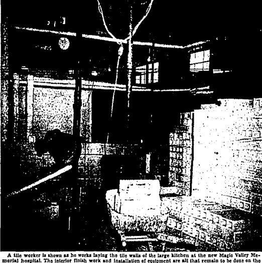
A tile worker is shown as he works laying the tile walls of the large kitchen at the new Magic Valley Memorial Hospital. Plasterers, millworkers and the tile men are rushing their work.