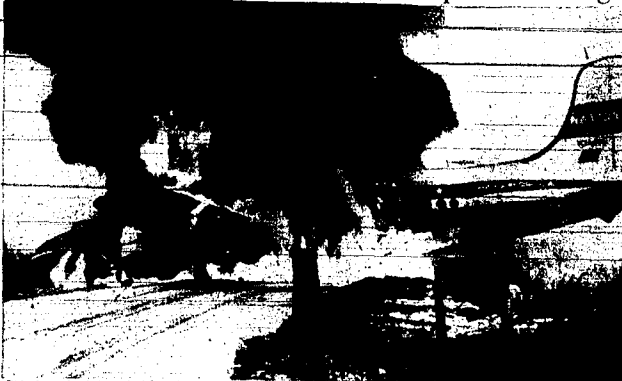
This dramatic photograph, taken shortly after a National Air Lines plane crashed at the Philadelphia International airport, shows one survivor in the ditch at right. The stewardess, four other women and two...