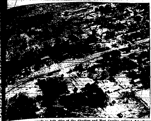
The air, Elitenton sprays on both sides of the Charleston and West Carolina railroads. Schoolhouses were destroyed, which just got a $30,000 addition, will disappear with the rest of four South Carolina towns in the H-bomb blast.