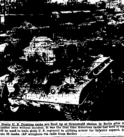
Heavy U. S. Fighting tanks are lined up at Grunewald station in Berlin after their arrival through the city.