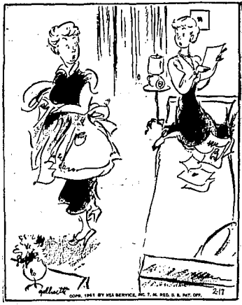
"I'll help you, Mom, after I answer these letters from boys in the service—we have to be patriotic!"