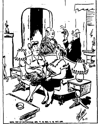
"Quigley poses as quite a forecaster of national policy since he saved the wallet for his old ration books!"