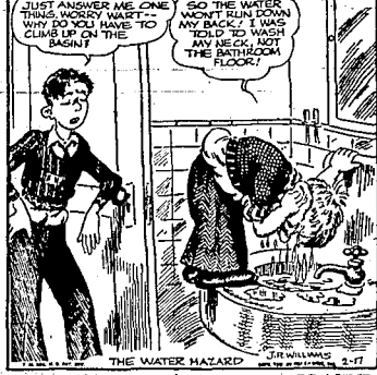
THE WATER HAZARD By WILLIAMS 2-17