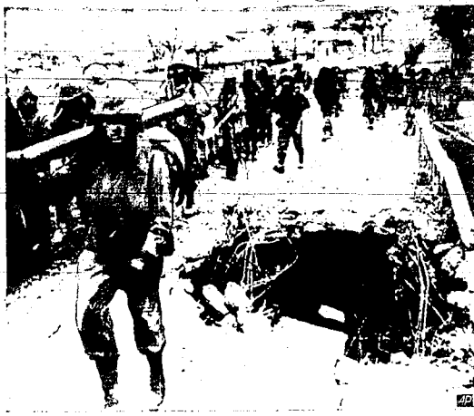
U. S. marines, back in action again, move over a cratered bridge as they advance on the central front in Korea. It was disclosed that the leathernecks were back in the fighting for the first time since their bitter withdrawal from the Changlin reservoir near the Manchurian border last December.