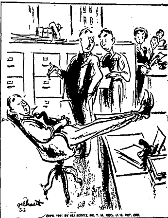
"This kind of man I like! He either works or loafs with all his might—he doesn't sit around shuffling papers!"