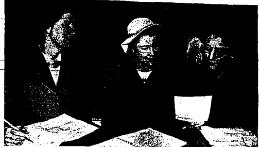
Reviewing Magie Valley Memorial Hospital guild activity in helping form a community blood bank committee...