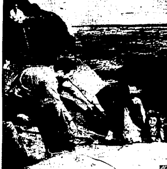
Sally Rees, 7-year-old, smiles with relief as her rescue from surf is completed at top of 60-foot high cliff near the Point Loma section of San Diego. She was trapped at foot of cliff by rising tide. Lifeguards lowered one of surf bunnies to her via chair and, as she held Sally in his lap, raised them both over the face of the cliff. (AP wirephoto)