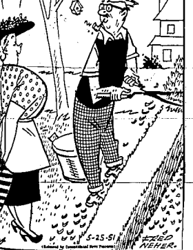
THIS week's present... I give myself a reward for not taking it on your salary!