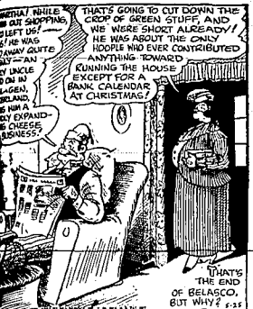
THAT'S THE END OF BELGICO, BUT WHY? 5-25