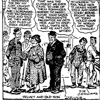
VELVET AND OLD IRON