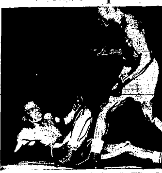
James Carter stands over lightweight champ Ike Williams after knocking him to the canvas in the 10th round of their title bout held in New York's Madison Square Garden. Shortly after this, the fight was started and Carter awarded the lightweight championship on a TKO.