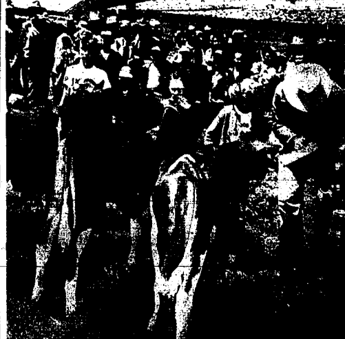
Three members of the Big Wood River 4-H club, Gooding, give their names to Fred Kohl, Lincoln county clerk, at the junior show of the first annual all-breed dairy cattle spring show at Filer...