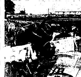
One of the eight Thunderbolts that crashed near Moreland, Ind., during a thunderstorm...