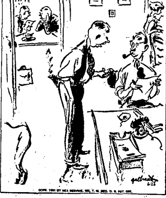
"That life insurance salesman has got the boss thinking about dying—it's a good time to ask for a raise!"