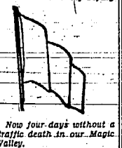
Now four days without a traffic death in our Magic Valley.