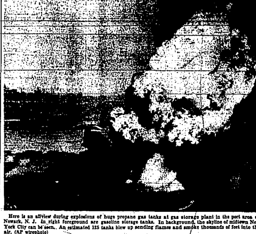
Here is an aerial during explosion of two propane gas tanks at gas storage plant in the port area of Newark, N. J. In right foreground are gasoline storage tanks. In background, the skyline of midtown New York City is visible. An estimated 125 tanks blew up sending flames and smoke thousands of feet into the air.