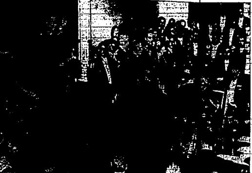
Twenty-year-old King Baudouin II, dressed in Lieutenant-general uniform, stands in front of his throne in the national house of representatives in Brussels as he takes the oath of allegiance.